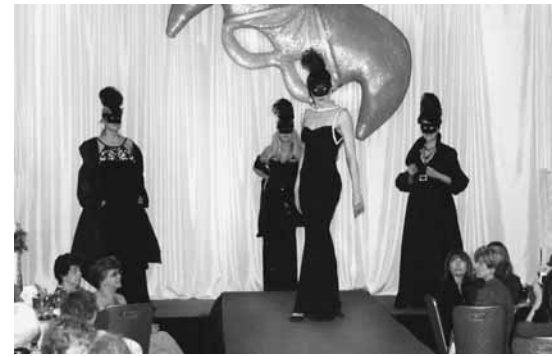
Stunning Models take to the runway in "Masquerade"