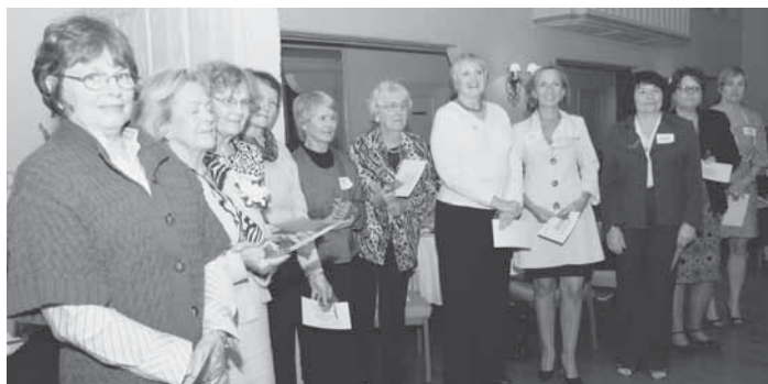
Outstanding Branch Members for 2008