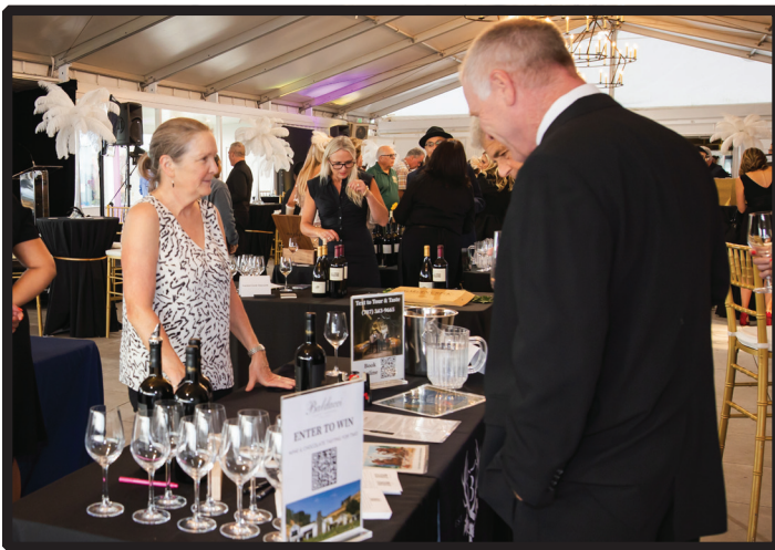
Attendees chatting with a winery representative