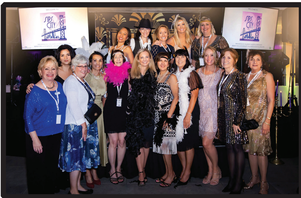
Branch members decked out in their art deco outfits