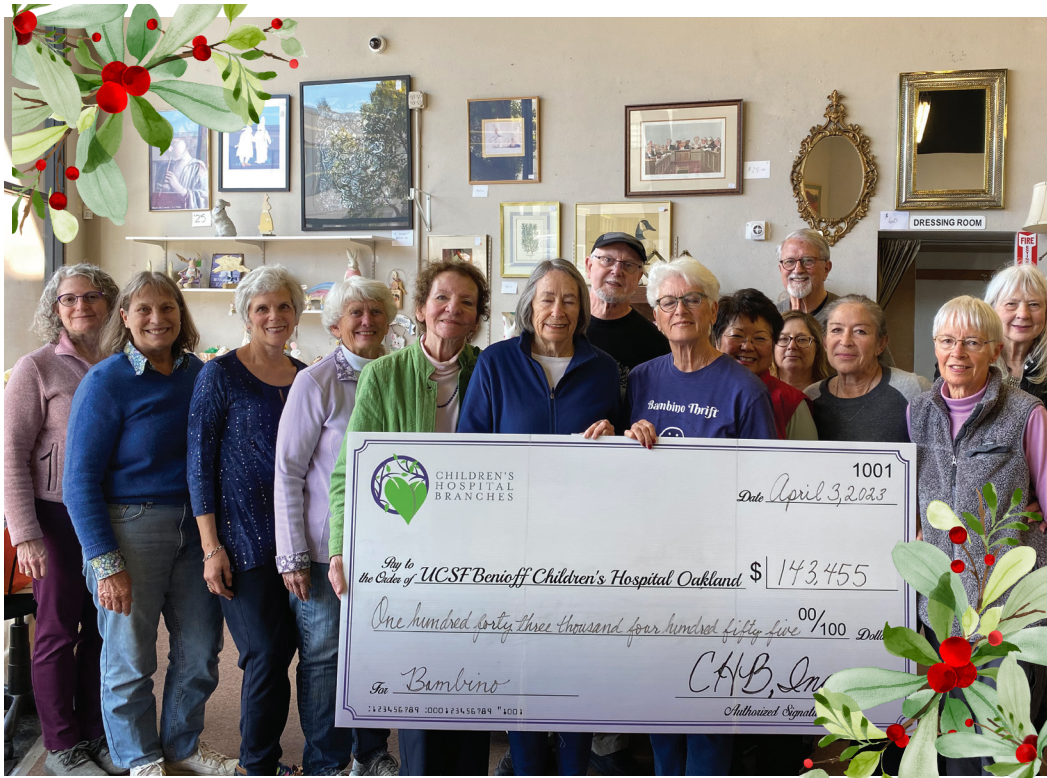
Earlier this year, Bambino volunteers gathered in the shop to celebrate their combined efforts to contribute $143,455 to the Branches in 2022.