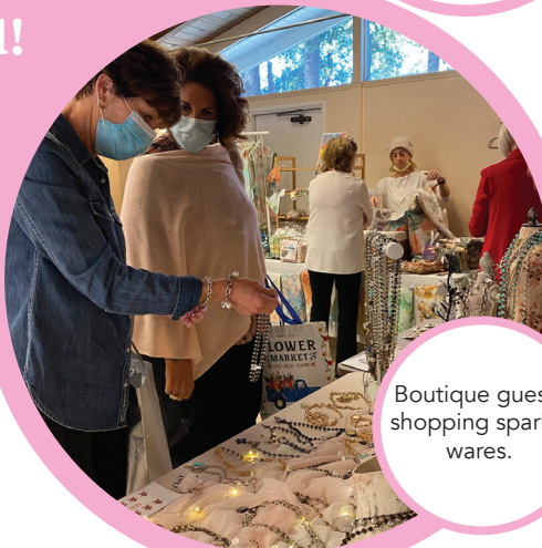
Boutique guests shopping sparkly wares.